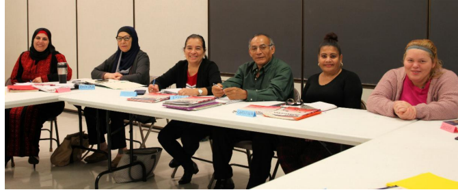
Beginner English class